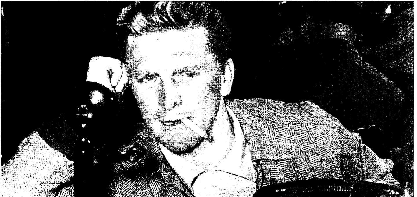
Smouldering: Kirk Douglas enjoys a cigarette in the 1951 film 'Ace in the Hole'. Anti-tobacco groups say such on-screen images help perpetuate the idea that smoking is glamorous